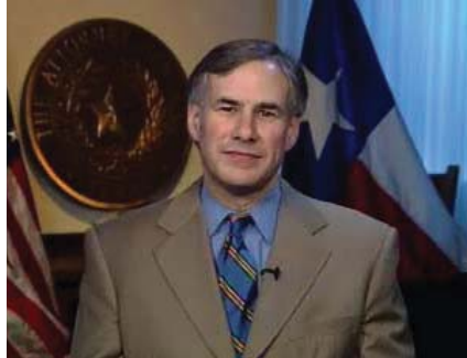
Texas Attorney General Greg Abbott

When the match shows an obligor who meets the statutory criteria for license suspension as holding one or more TABC licenses/permits, the OAG will provide the license/permit holder with a warning and an opportunity to resolve the outstanding delinquency. If the obligor