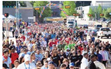
Participants of the 2010 Walk Like MADD 5K Event in Dallas, Texas.

support Mothers Against Drunk Drivers (MADD) North Texas, which provides 31 counties with community education, victim support services and youth programs.